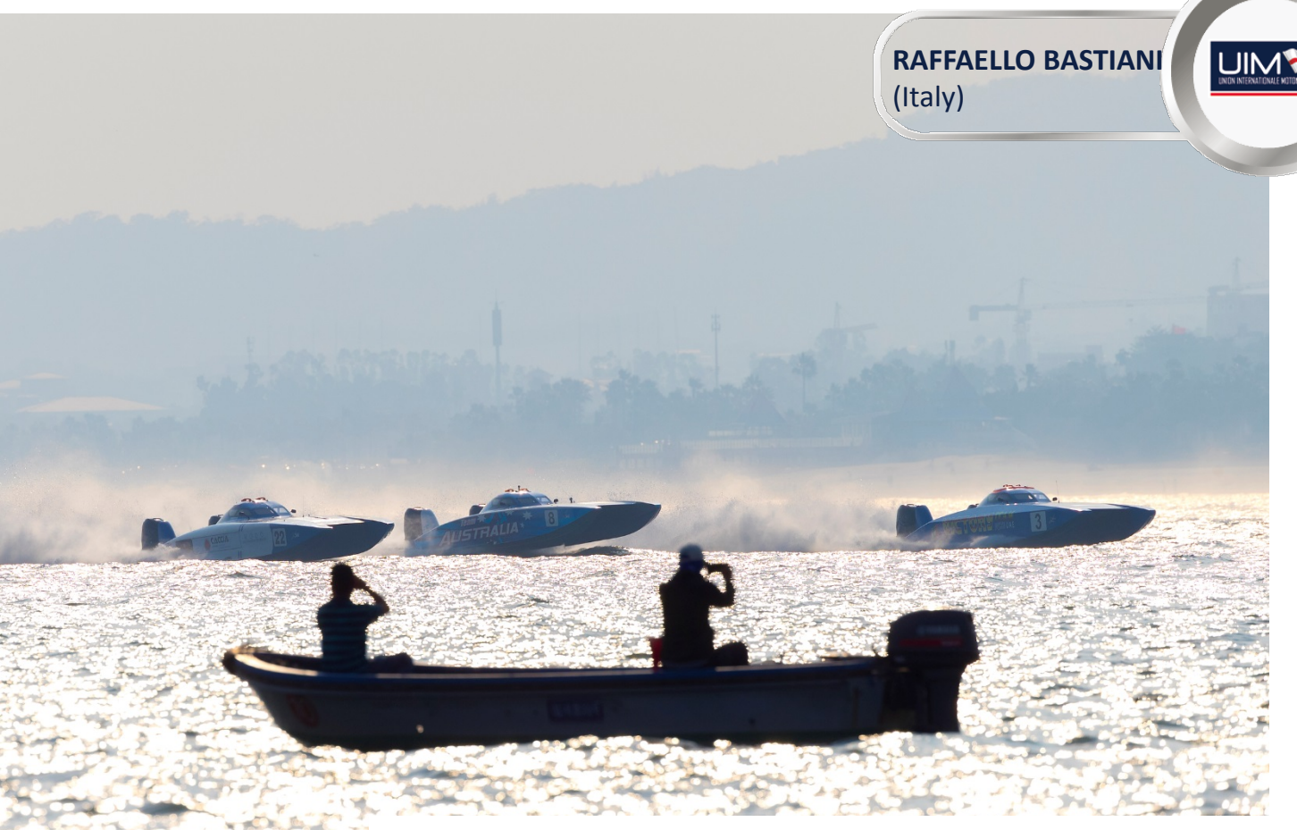
2017 UIM XCAT World Championship, Xiamen GRAND PRIX, 27-29 October)