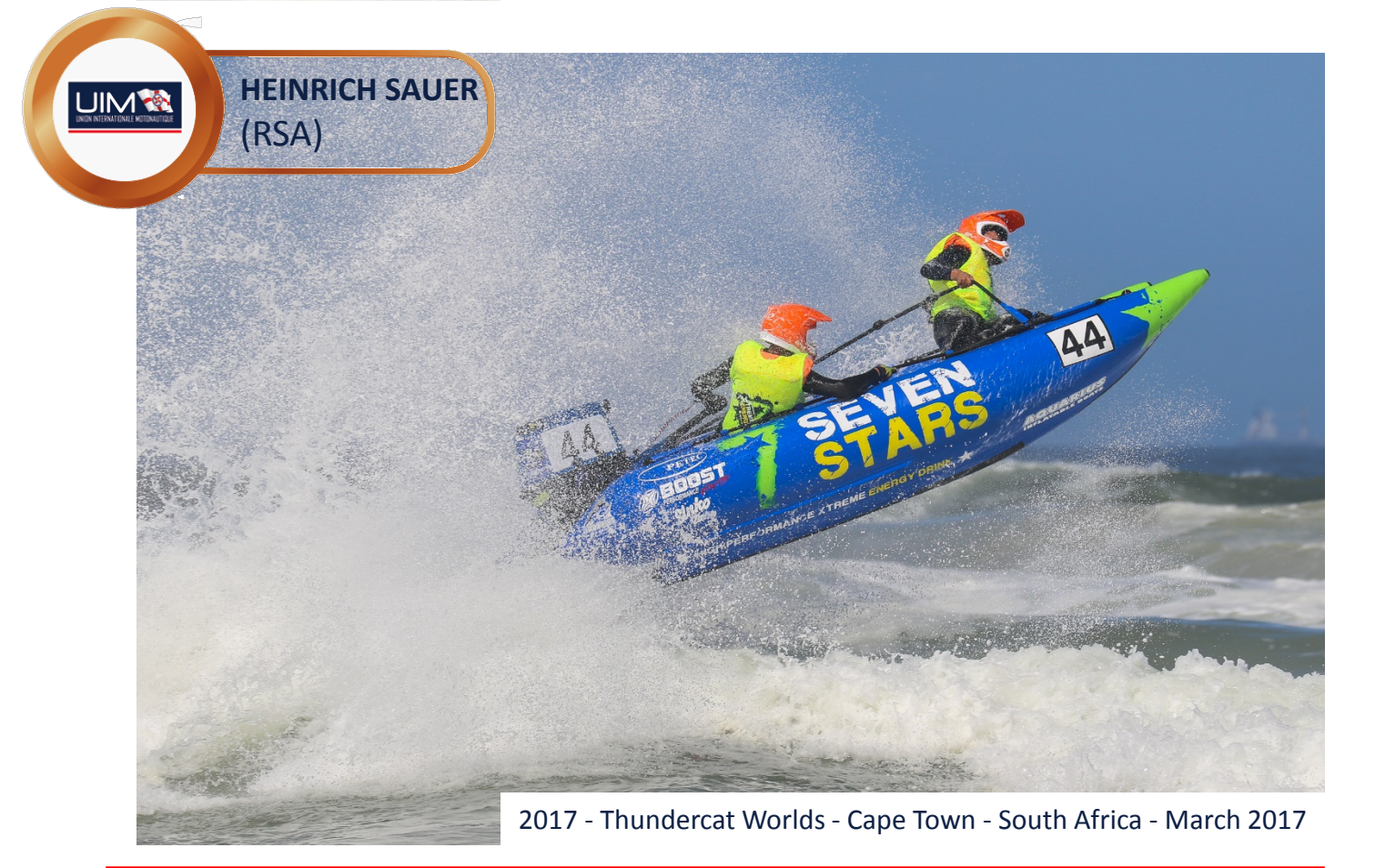
About the Union Internationale Motonautique. The UIM is the world governing body for all Powerboating activities, including Aquabike. It is fully recognized by the International Olympic Committee (IOC) and is a member of the Association of the IOC Recognized International Sports Federations (ARISF) and of SportAccord for whom the UIM President serves respectively as President and Vice President. The UIM has 63 affiliated National Federations. Circuit, Offshore, Pleasure Navigation and Aquabike are among the main disciplines. The UIM has signed a Cooperation Agreement with the United Nations Environment Program (UNEP) to further its range of environmental initiatives, share expertise and work together for "greening" the Sport.