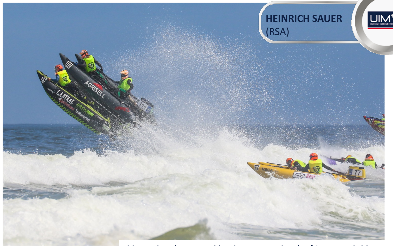
2017 - Thundercat Worlds - Cape Town - South Africa - March 2017